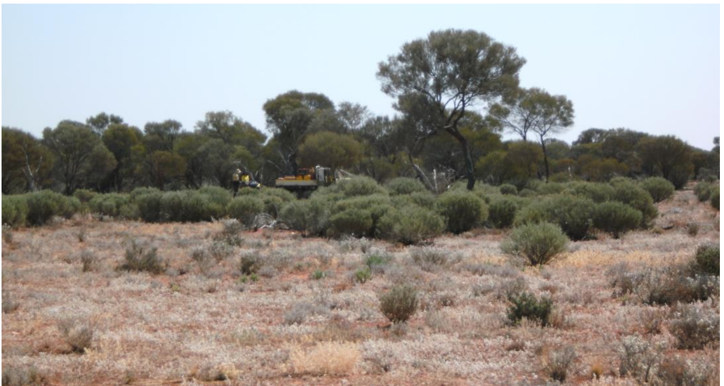
Figure 2 – Geophysical crew on the ground conducting first pass MLEM survey at Kingfisher.

A follow-up Moving Loop Electromagnetic (MLEM) survey will be undertaken as soon practicable to determine and fully test the exact extent and spatial position of the conductors, with a view to subsequently testing the features with Reverse Circulation and/or diamond drilling.