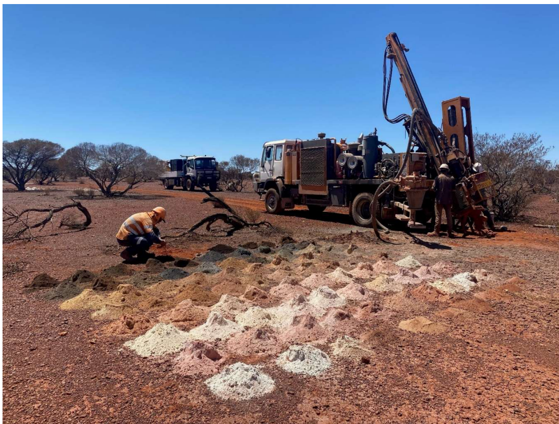
Figure 3. KTE Drilling AC rig currently drilling at Eagle.

The program will be underpinned by the $12.0M Placement and $3.0M SPP Offer announced on 10 February.