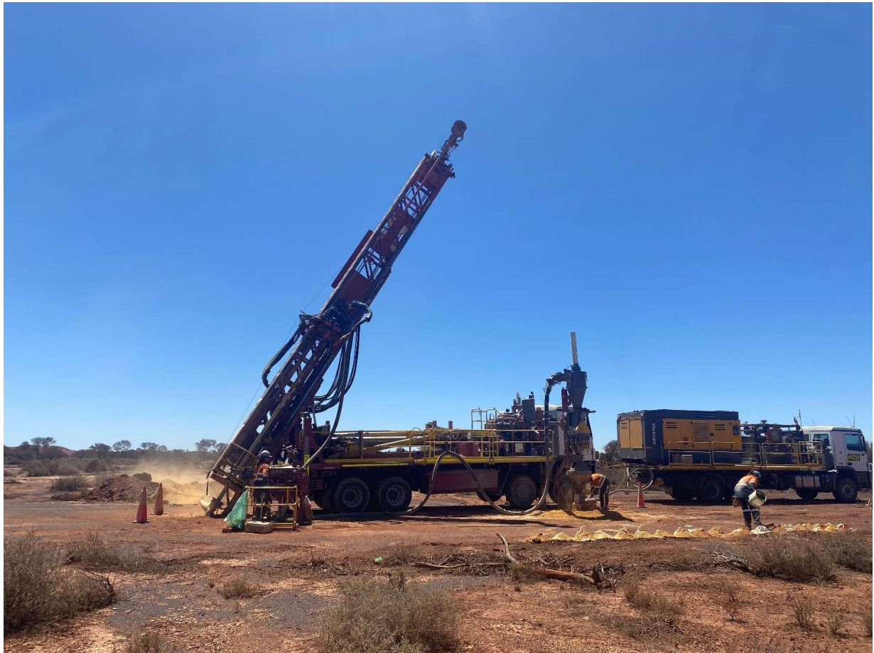
Figure 1. K Drill RC rig currently drilling at Bruno Lewis.

Previously-reported highlights from Bruno Lewis include 10m at 10.8g/t Au from 15m (BL20RC107), 14m at 6.09g/t Au from 39m (BL20RC127) and 16m at 4.15g/t Au from 40m (BL20RC120) (see ASX Announcement 25 January 2021).